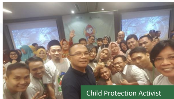
Child Protection Activist