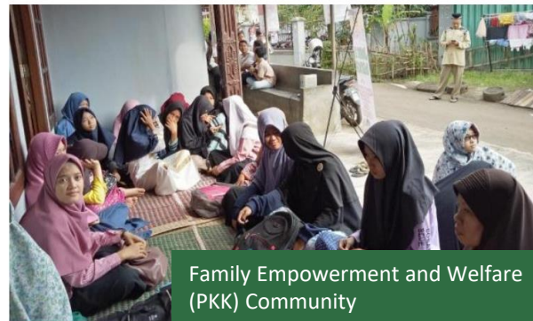
Family Empowerment and Welfare (PKK) Community